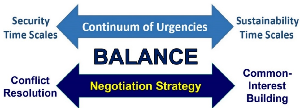
FIGURE 1: INFORMED DECISIONS operate across a ‘continuum of urgencies’ as a scalable framework – illustrated for peoples, nations and our world from security to sustainability time scales – with ‘conflict resolution’ and ‘common-interest building’ as negotiation strategies to achieve balance with issues, impacts and resources at local-global levels. 5

The starting point for that NATO-Russia dialogue was science diplomacy , as an holistic (international, interdisciplinary and inclusive) process to balance national interests and common interests for the benefit of all on Earth across generations . Operation of this holistic process became clear in 2016 during the 1 st International Dialogue on Science and Technology Advice in Foreign Ministries , 2 when the ‘continuum of urgencies’ was identified from security time scales (mitigating risks of political, economic, cultural and environmental instabilities that are immediate) to sustainability time scales (balancing economic prosperity, environmental protection and societal well-being across generations). The following year, the theoretical framework of informed decisionmaking (Figure 1) – operating across a ‘continuum of urgencies’ short-term to long-term – emerged with the case study published in Science 3 about the 2017 Agreement on Enhancing International Arctic Scientific Cooperation , which has entered into force among the eight Arctic states. With continuing acceleration, in 2020, Springer published the first volume in the new book series on INFORMED DECISIONMAKING FOR SUSTAINABILITY. 4